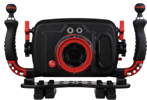
Sony RX100 IV/V