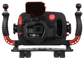
GoPro Hero 5/6/7