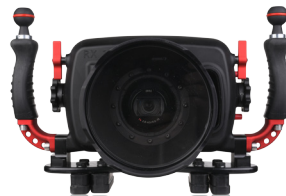
Sony RX100 VI