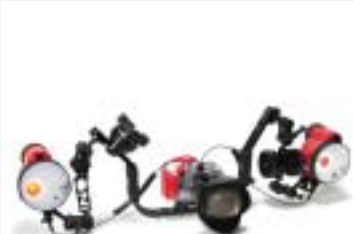
CAMELIA C-60Z Set