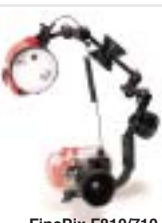
FinePix F810/710 Set