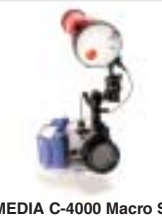
CAMELIA C-4000 Macro Set