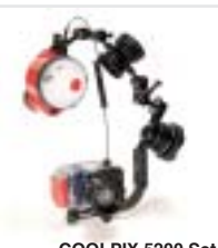
COOLPIX 5200 Set