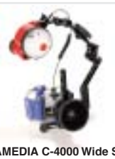
CAMELIA C-4000 Wide Set