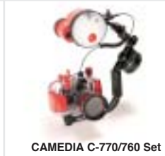
CAMELIA C-770/760 Set