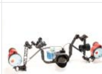
PowerShot S50 Set