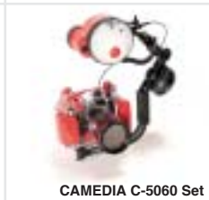
CAMELIA C-5060 Set

For users just starting out but intending to shoot both Wide Angle and Macro images. Ease of just one standard setting for most situations with D-2000 / S-TTL lets you concentrate on the subject. Full line-up of best quality optical glass conversion lenses to support your imaging endeavors.