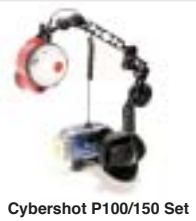
Cybershot P100/150 Set