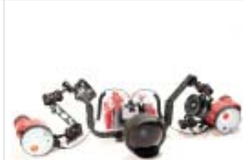
CAMELIA C-5050 Set

Going one step further to create truly extraordinary images. Of course, easy, automatic exposure control is possible with Inon's optical connector system and TTL auto exposure D-2000 S-TTL strobes. But using multiple strobes and user determined settings enables new opportunities. Each D-2000 strobe has 24 steps of External Auto adjustment control and 13 Manual settings, so it is possible to freely set the Right/Left strobe lighting output to adjust flash balance, creating subtle shadow variations, giving the image a three dimensional feel. With access to the full range of attachment lenses, create images from fisheye to ultra macro. Expert sets help make our best potential a reality.