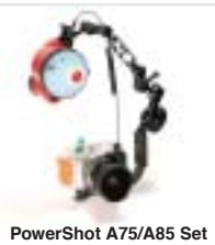
PowerShot A75/A85 Set