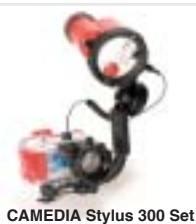
CAMELIA Stylus 300 Set