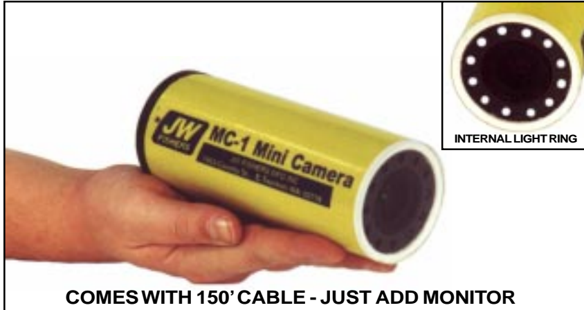
COMES WITH 150' CABLE - JUST ADD MONITOR