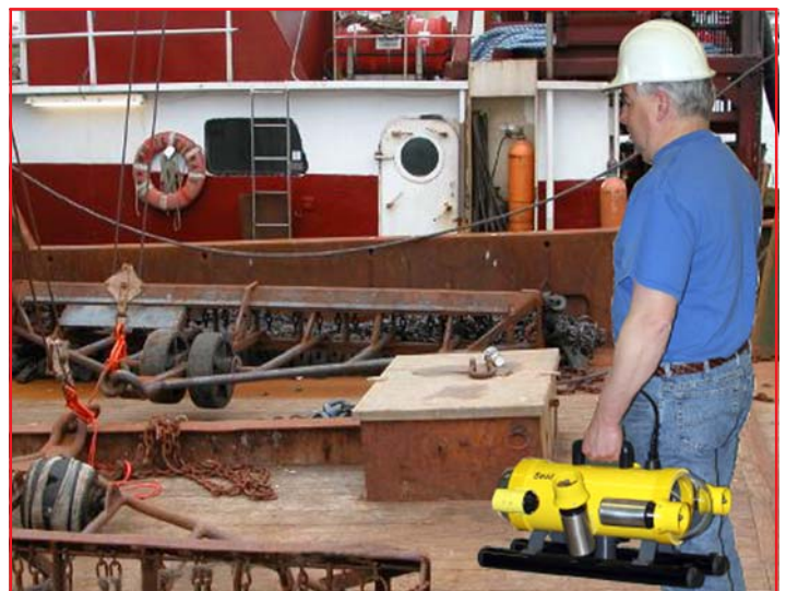
Fishers ROVs are in commercial use Worldwide

At 43 lbs, the ROV is highly portable and very "user friendly". With the optional spare parts kit, the ROV is completely field maintainable. JW Fishers SeaLion-2 ROV system represents a major breakthrough in cost/performance for a commercial grade ROV. This high performance system competes with systems more than twice the price. The SeaLion-2 is covered by a TWO YEAR WARRANTY.