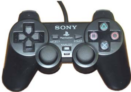
A PS2 Controller's joysticks and buttons control the ROV

When a high water current situation arises where extra power is needed, a button on the controller increases the maximum power available by 30%; significantly increasing thrust.