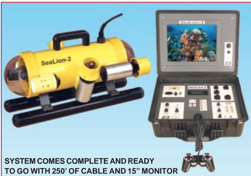
SYSTEM COMES COMPLETE AND READY TO GO WITH 250' OF CABLE AND 15" MONITOR