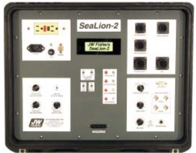
Control Panel's switches, controls, and interface connectors

The Control Panel also contains a LCD readout which displays the overall status of the system.