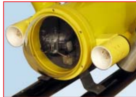
Pan and Tilt Cameras (front and back) with 200 watts of adjustable Lighting

Illumination is provided by two, 100 watt, fully adjustable (0 to 200 watts) tungsten halogen lamps for the front camera and a "ultra-bright" LED cluster for the rear camera.